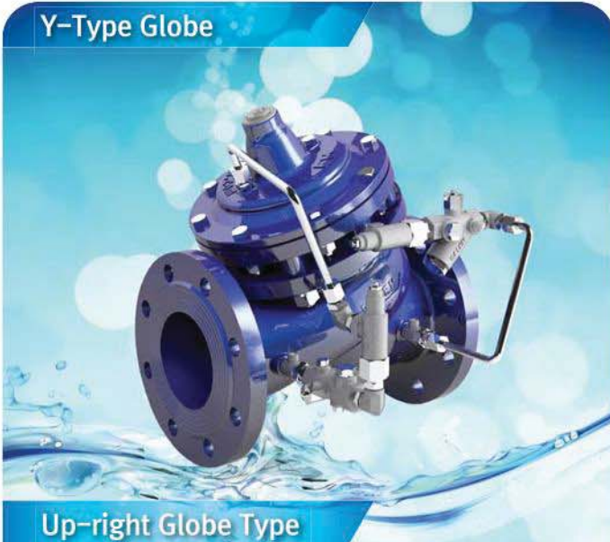
Up-right Globe Type