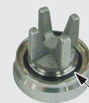
Soft seat (O-ring)